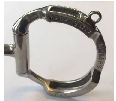
New style Cheek with Loop, which makes it easy to use a curb strap and hooks

A curb chain or strap used with a Myler snaffle will sit significantly higher on the back of the horse's jaw than a curb used with a traditional Pelham or Weymouth. This does not cause the curb pressure to be any less effective or more harsh in any way. It is simply used as a stabilisation point and pressure area for the horse to respond to. In addition, the pressure higher up on the jaw is spread over a larger area than when used on the chin groove.