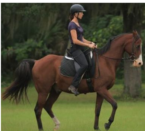
This horse's face may be on the vertical, but purely because of hyperflexion at the top of the neck. Look at the tension in the neck and along the whole body as well as the stress in his eye. The horse cannot move forward freely.

Curb straps exert forward and downward pressure, which encourages the horse to flex from the base of the neck, rather than merely from behind the ears. This generates a better outline because stretching his neck forwards and down helps the horse raise his withers, so it is easier for him to get his hindlegs under him and move “uphill”.