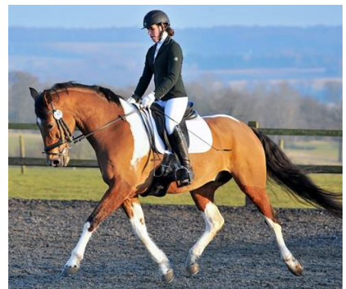
Here, the horse is “rolling over” from the base of the neck. He has a rounded, “uphill” outline, so he is lighter in front and better able to get his hindquarters underneath him. He is moving well and also looks much more comfortable and relaxed.

Flexion from the base vs the top of the neck can be a subtle difference to the eye and is affected by the horse's confirmation, but it makes a significant difference to his way of going, not to mention his comfort.