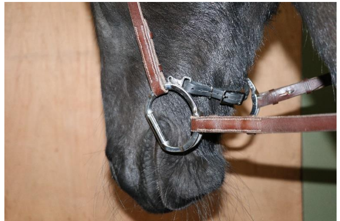
New style Eggbutt with Hooks. Curb Strap attached with small hooks to the loop.