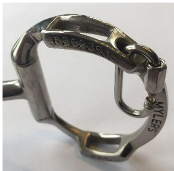
Original Cheek with Hole, shown with Quick Link Carabiner attached

Another benefit of utilising different pressure areas is that it helps the rider to ride with a lighter, gentler hand. For this reason, the Mylers advocate the use of curb pressure with novice riders and children. It allows the rider to learn the 'feel' of riding lightly, allows the horse to have distributed pressure for softer signals, and also helps the beginning rider maintain control without a high degree of rein pressure.