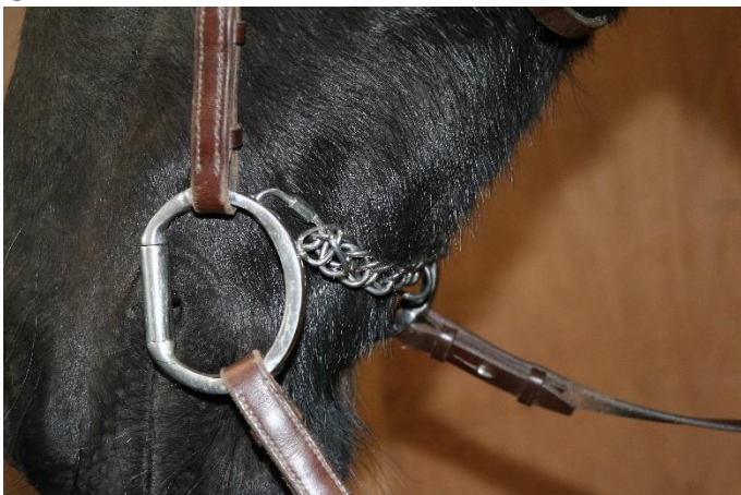
Original style Eggbutt with Hooks. Curb Chain attached with Quick Links through the hole.

A curb chain or strap used with a Myler snaffle will sit significantly higher on the back of the horse's jaw than a curb used with a traditional Pelham or Weymouth. This does not cause the curb pressure to be any less effective or more harsh in any way. It is simply used as a stabilisation point and pressure area for the horse to respond to. In addition, the pressure higher up on the jaw is spread over a larger area than when used on the chin groove.